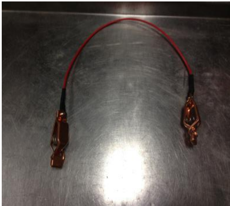
Figure 2 Connector to attach an electrode to the switching cable